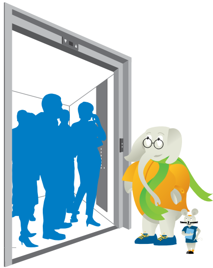
If the elevator is full, wait for the next ride.