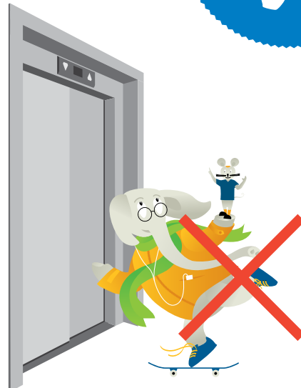
Do not play in or around the elevator.