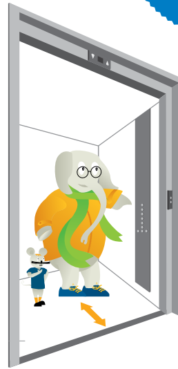
When riding the elevator, stand in the back of the car facing forward.