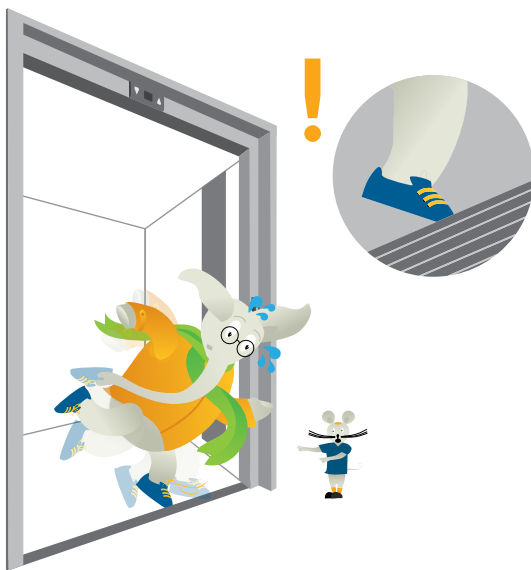
Watch your step when entering or exiting the elevator, as it may not be level with the ground.