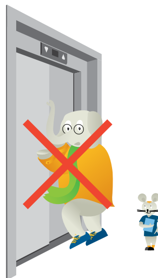
Do not attempt to force the elevator doors open.