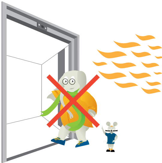
Do not use elevators in case of fire or other emergency.