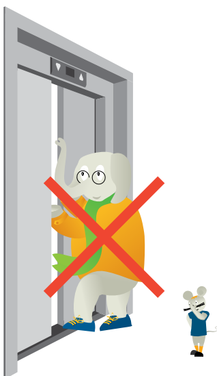
Do not place anything including your hands between or on the elevator doors, and do not lean on the doors.